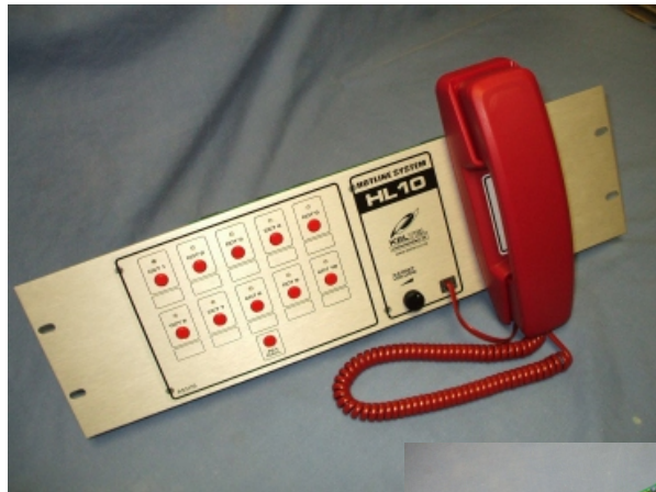
FRONT CONSOLE VIEW

The functional diagram below shows two operational modes, one with the telephone interface equipment locally for operating over two wire lines and the other where a mux is used to distribute the hotline handsets to remote locations over a private closed network.